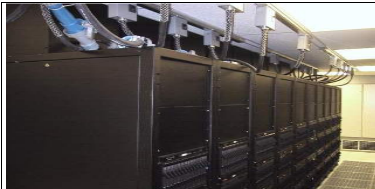
Figure 3 : “Exotic” data center cooling technologies like this in-row liquid cooling system are costly to install and maintain. They also expose sensitive server hardware to the dangers of leaky pipes.

Of course, organizations can always limit a thermal impact of a 50A PDU, and thereby eliminate the need for exotic cooling, by running it below capacity. But why invest extra in a 50A product if you intend to use only part of its capacity?